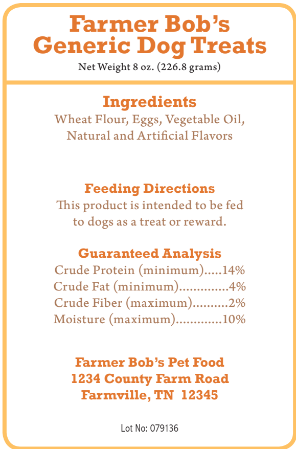
Figure 1. Example of Acceptable Pet Treat Label