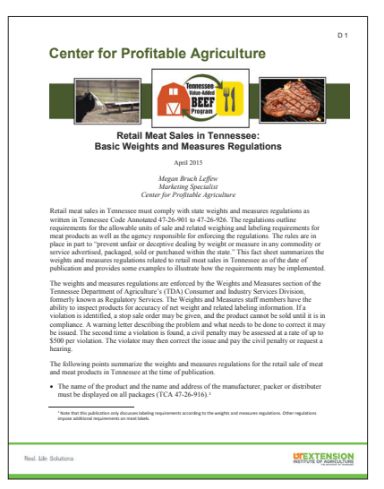
Retail Meat Sales in Tennessee: Basic Weights and Measures Regulations https://tiny.utk.edu/D1-CPA