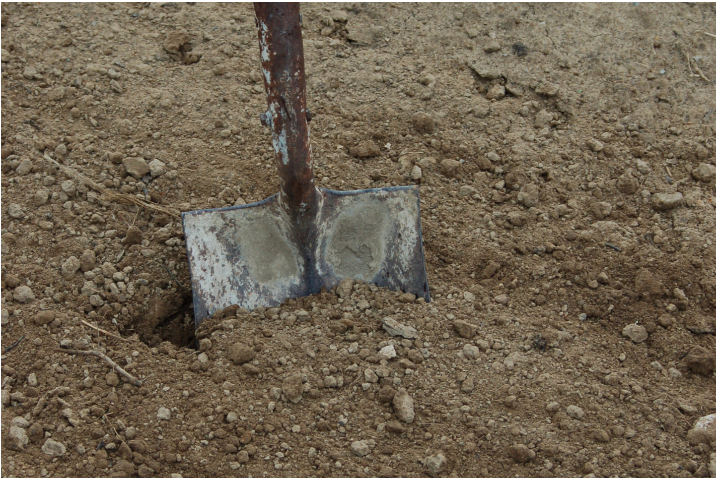
Figure 1. Medium textured soil that is workable for at least 6 to 8 inches is most desirable for gardens.