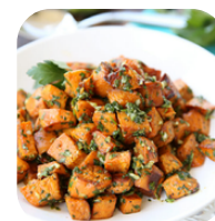
Roasted Sweet Potatoes with Chimichurri