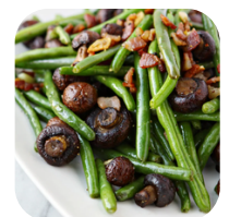
Sautéed Green Beans with Bacon & Mushrooms