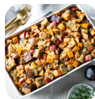
Sweet Potato, Sausage & Apple Casserole

Many favorite holiday dishes begin with a healthy main ingredient, like sweet potatoes, green beans, pumpkin, white potatoes or apples. These are star ingredients that have great flavors on their own and are members of the healthful fruit and vegetable groups. The large amounts of fats and sugars added, though, cause the dishes to become less healthful. The good news is that veggies are beautiful, so here are some healthier versions to inspire your holiday table!